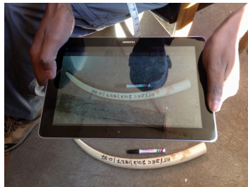
Taking a photo with the App

The aim is for storeroom managers to be able to digitally record data on ivory entering the storeroom on the day it arrives. Once new data has been entered into the App, the data is uploaded onto the Server using Wi-Fi or mobile data. This results in realtime stockpile data on the Server.