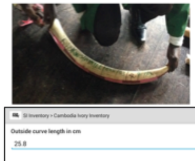
Measuring in and entering the data on tusk length